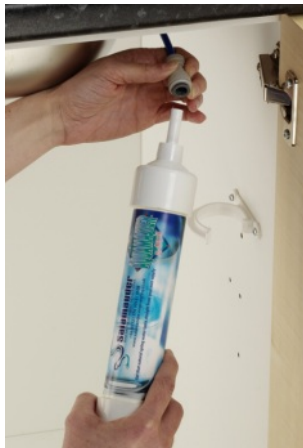
Refilling of Aquamaster Mini