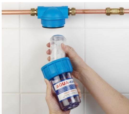
Refilling of AQUA-care