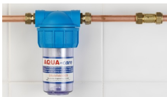
AQUA-care in situ